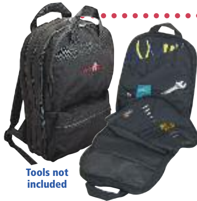
Tools not included